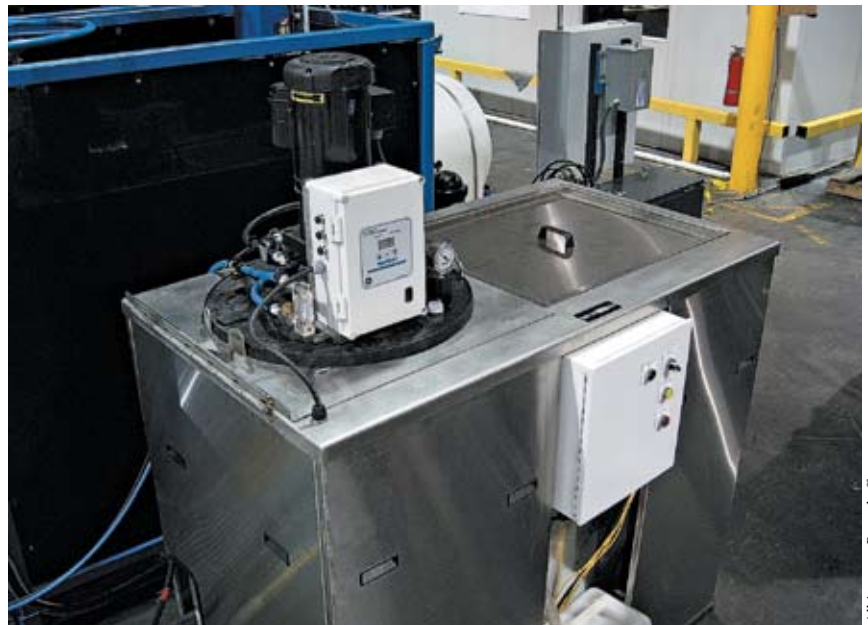
Deerfield Manufacturing installed a 360 gal./day UF system that effectively turns over its wash tank every fourth day.

However, a more likely scenario for most shops and manufacturers is that they are dealing with water-soluble oils, emulsifiable fats and oils and a high level of fine particulates. In these cases, conventional oil skimming and particle filtration methods are not sufficient to maintain solution bath integ-