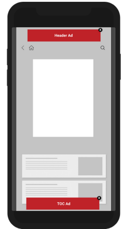
TOC ON MOBILE