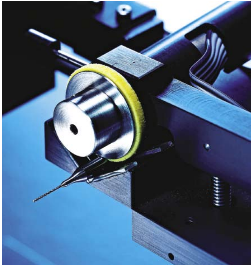
Measuring a microtool in a rotary V-block with zero runout.

Everyone involved in micromachining—from researchers to machinists—identifies runout as the single most important success factor. The reason, again, is tool size. If one cutting edge is 1\mu\text{m} further away from the tool center