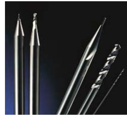
Microtools ranging in size from 0.1mm to 3mm.

using smaller tools is visually evident. An operator often cannot even see what size they are without visual aid. That means tool storage must be more disciplined, using correct labeling so tools can be readily identified.